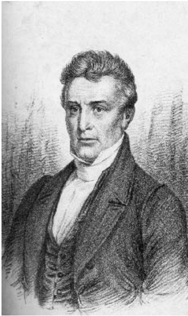
Alexander Campbell in his prime