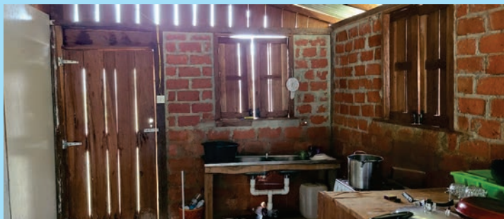
The kitchen end of the Amerindian guesthouse at Monkey Mountain

We continue to covet your prayers for our health so we can both make the 2023 Guyana trip. We are also so very thankful for your financial support. Without your help, these mission trips would be impossible. There is no way we could go without you all. God bless you and keep you all safe. You are in our prayers often. 📖