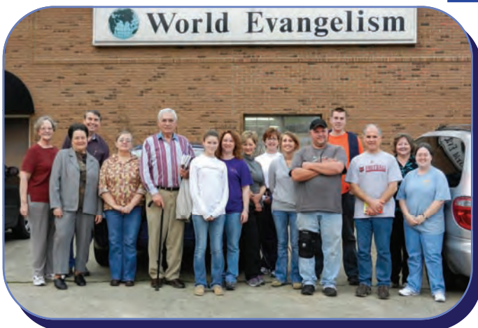
Workday Crew ~ January 2013