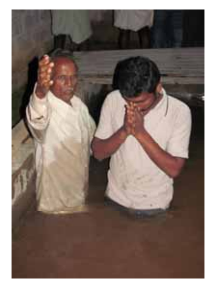
(Continued on page 11)

Finally, there were 20 baptisms observed these eight weeks. We do not count them as especially connected with our visits. because brethren worked with these new converts prior to our arrival. Our presence merely providadditional